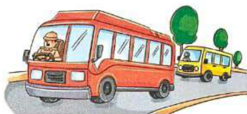
bus and van