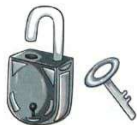
lock ..... key