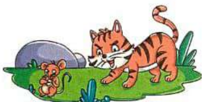
rat and cat