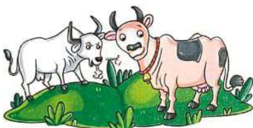
ox and cow