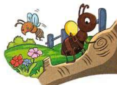
wasp and ant