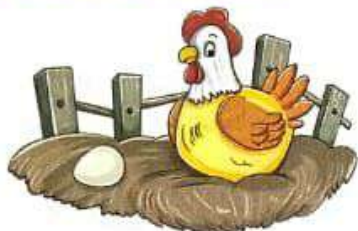
hen and egg