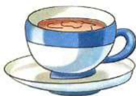
cup ..... plate