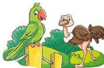
parrot and ostrich